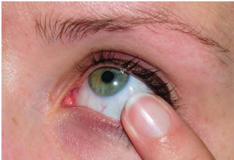
Sliding a soft lens off-centre to release a foreign body