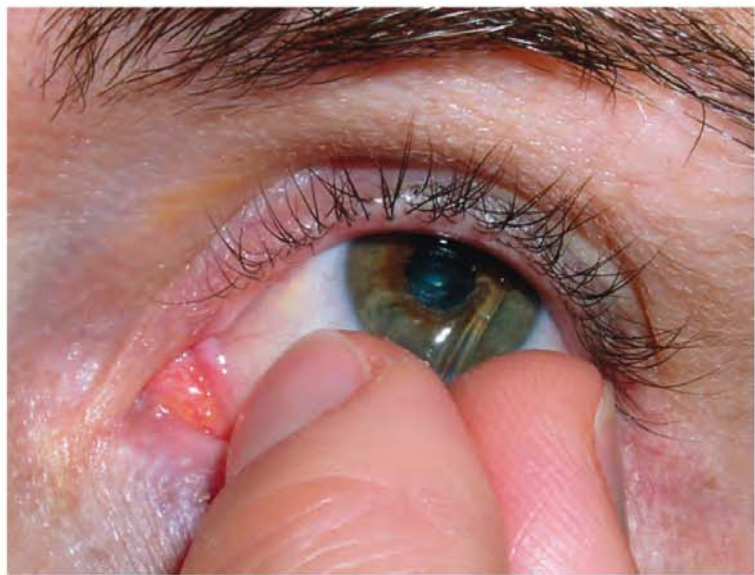
Soft lens removal without holding the upper lid