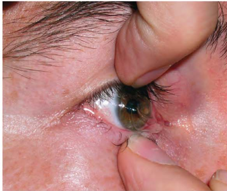
(a) Scissor removal of a soft lens showing the lid positions; (b) showing the lids scooping the lens out