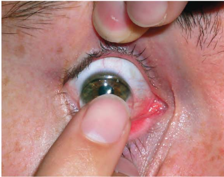
Soft lens insertion. Note how both lids are held apart