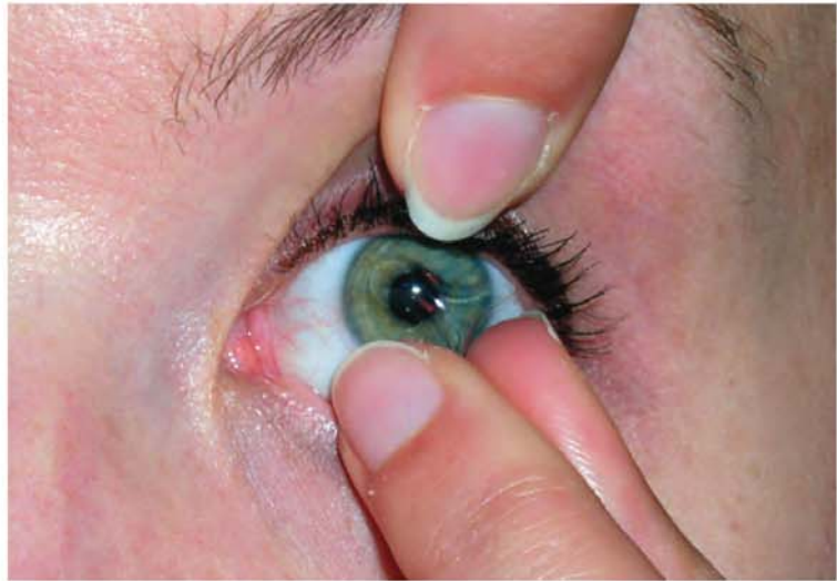
Gently folding and pinching a soft lens to remove it